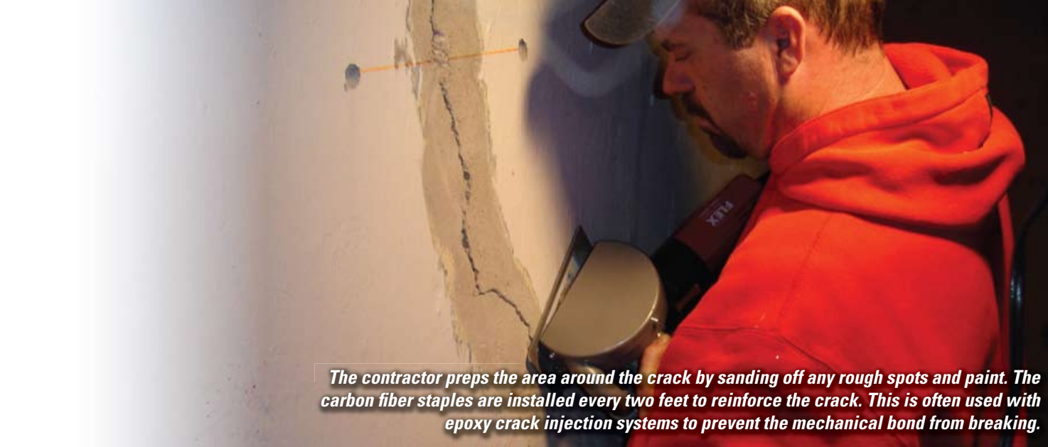
The contractor preps the area around the crack by sanding off any rough spots and paint. The carbon fiber staples are installed every two feet to reinforce the crack. This is often used with epoxy crack injection systems to prevent the mechanical bond from breaking.